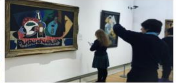
The National Gallery Of Ireland

Students are brought on a guided tours of the National Gallery where they learn about paintings, curators and the Gallery itself.